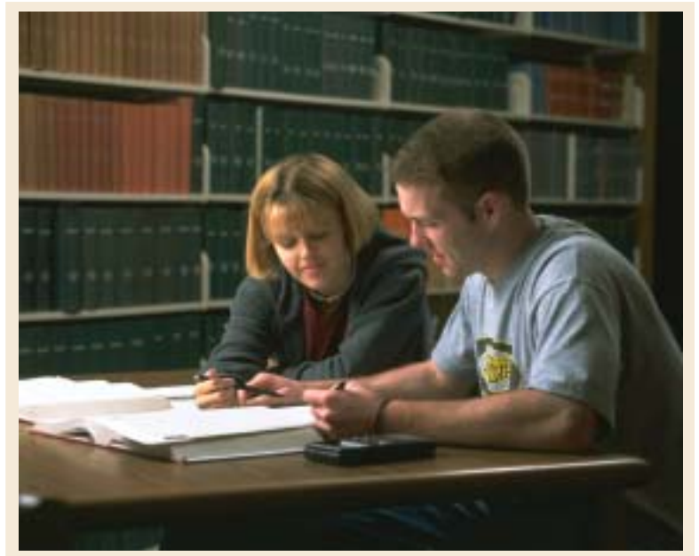
Students studying at the Ruby E. Dare Library